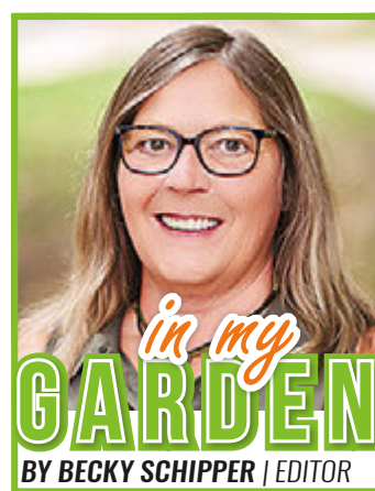
in my GARDEN BY BECKY SCHIPPER | EDITOR

Have a good week. Think of bright yellow flowers and do consider adding some tulips to your beds for next spring! ●