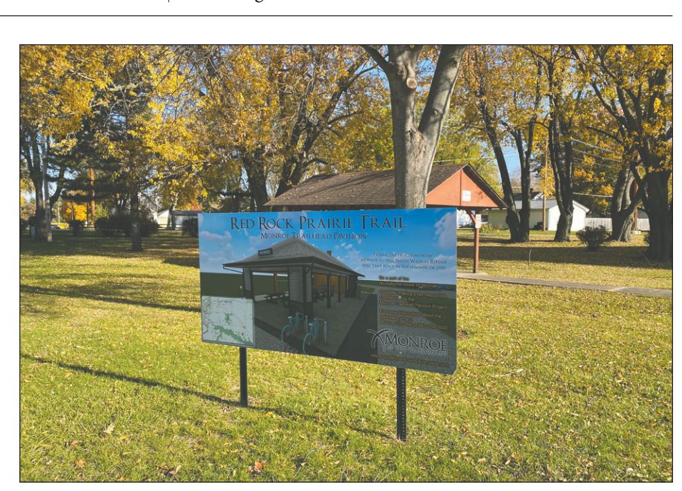
Construction for the Red Rock Prairie Trail, which will run from Monroe to Prairie City, is planned for spring 2022. The City of Monroe is currently fundraising for a Trailhead Pavilion to be located near Red Rock Park. Photo credit goes here

The portion of the trail that will begin construction in the spring spans from Monroe through Prairie City to the entrance of the Neal Smith National Wildlife Refuge. Currently, the trail has a gravel base but will become a concrete pathway for bikers, runners, walkers and more to use.