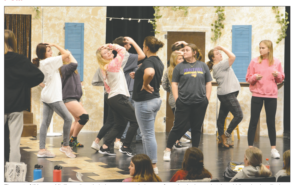
The cast of "Mamma Mia!" practices their dance moves during an after school rehearsal at the middle school auditorium. The musical will hit the stage this weekend with performances Friday, Saturday and Sunday.