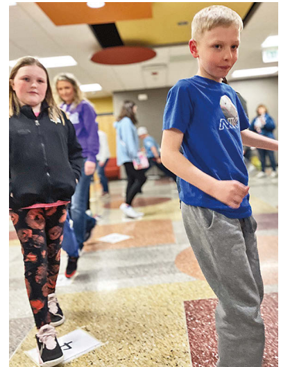
The Cake Walk proved, once again, to be great fun for all ages.