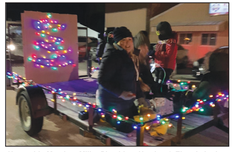
Honorable Mention, Miller Plumbing, Heating & Electric in the Menlo Lighted Parade

MADISON, ADAIR & DALLAS COUNTY, IA | BID NOW AT BID.DREAMDIRT.COM