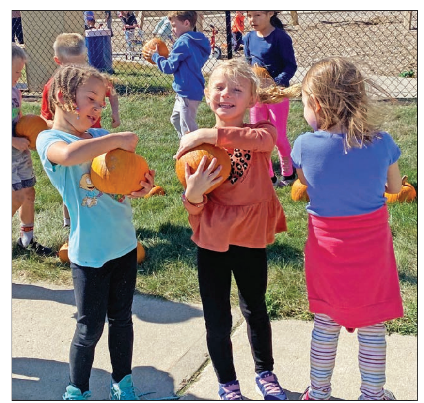
This group of students, above, and this second-grader, at right, were excited to show off the pumpkins they selected.