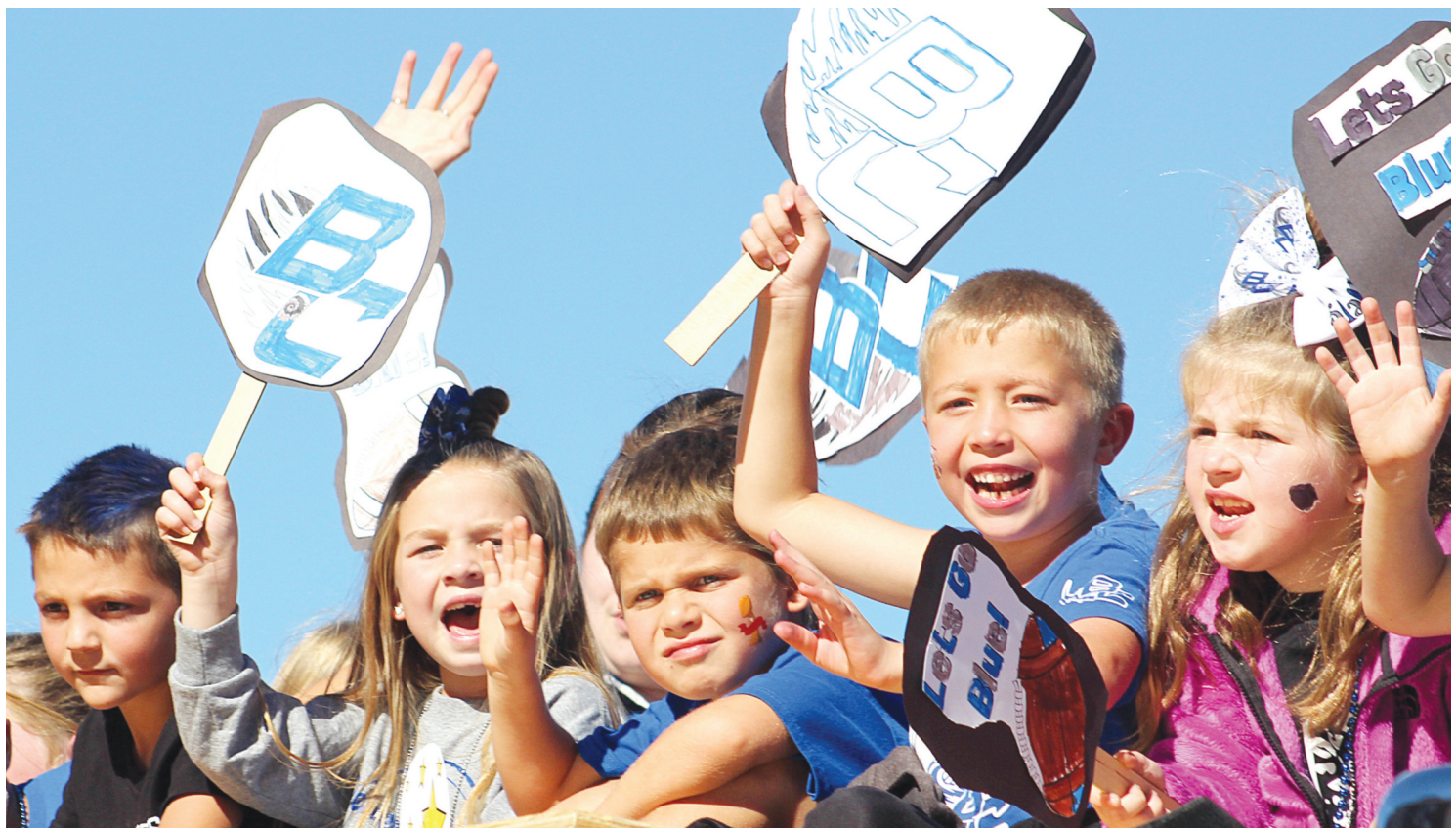
BELLEVUE ELEMENTARY STUDENTS riding on top a fire truck display their spirit during the 2022 Bellevue Homecoming Parade last Friday in Bellevue. The Comets took on East Buchanan Friday night. SEE MORE PARADE PHOTOS ON PAGE 28