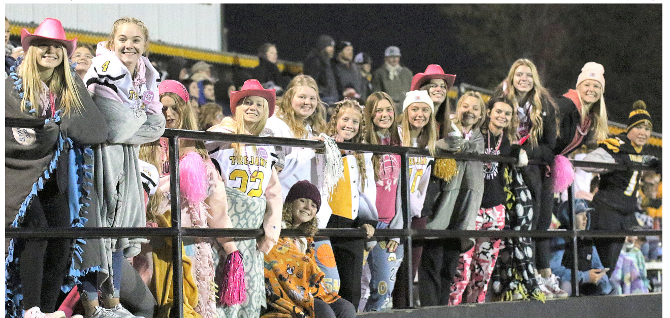
The Trojan fans were cheering for an overtime win against Woodbury Central Friday night at Neola.