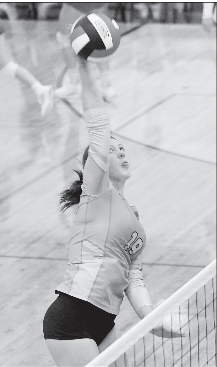
Troy Hyde/Newton News

Statistics for the four matches were not available at press time.