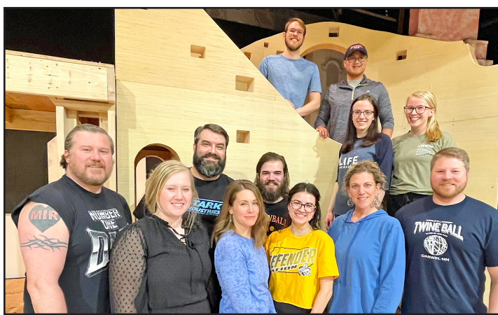
Night show at city hall Mamma Mia! will hit the Night Show stage at Town Hall on Monday, May 16, and run through Saturday, May 21, capping Tulip Festival 2022. Shown here are cast members chosen for the major roles. (Photo submitted)