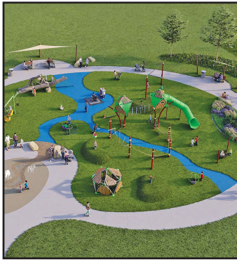
City plans new park Residents of Orange City were invited to view renderings for a new Puddle Jumper Park on Wednesday, Feb. 23, 2022. Plans for the park focused on inclusive play for all ages, genders, ethnicity and physical, mental, and emotional abilities. (Rendering submitted)