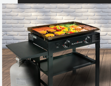
BLACKSTONE 28" GRIDDLE

NEW HOME LOAN APPLICATIONS APPROVED THROUGH SEPTEMBER 30, 2023, THE APPLICANT CAN CHOOSE BETWEEN 1