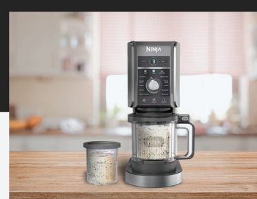
NINJA CREAMI DELUXE 11-IN-1 XL ICE CREAM MAKER