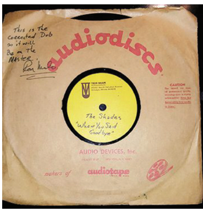
— Submitted photo

On the A side, The Shades recorded their original song, "When You Said