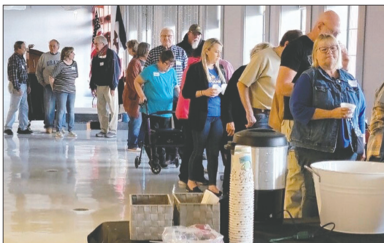
The Jasper County Democratic Party held its annual soup supper fundraiser on Oct. 15 at Legacy Plaza. The event is held every year a month or so before Election Day as way to drum up extra funds for candidates and get party members energized for last-minute canvassing.

Local Democrats line up for annual soup supper fundraiser