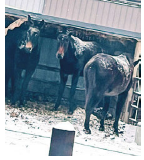
Temperatures plummeted as the winds increased Thursday. These horses huddled together in their shelter to stay warm.