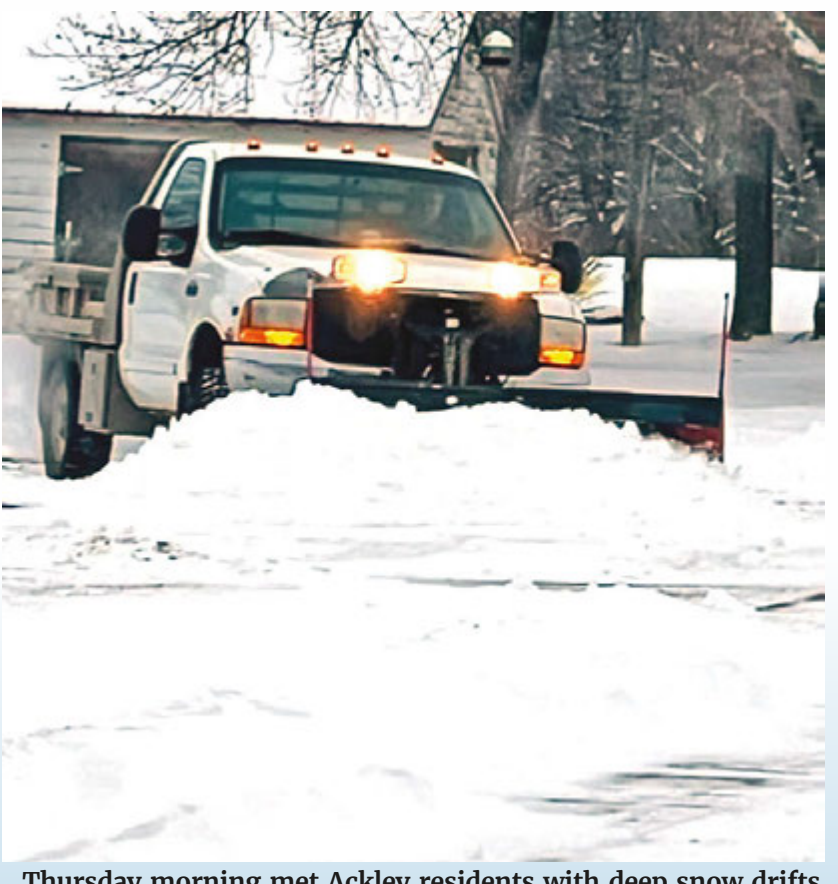
Thursday morning met Ackley residents with deep snow drifts blown by the high winds. Plow trucks could be found all over town working swiftly to clean up the streets.

Ackley homeowners worked diligently cleaning up the sidewalks and driveways of their properties, and of fellow neighbors as well. Seen all over town were men and women shoveling and blowing snow to help one another in the spirit of giving and neighborhood.