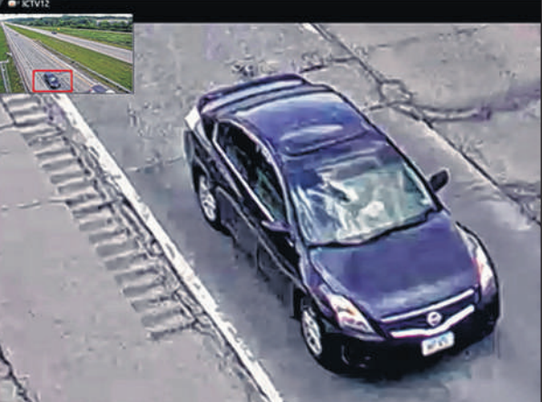
Iowa City police are seeking information from the public about this Nissan Altima and anyone associated with it. Police believe it was involved in a shooting Sunday.