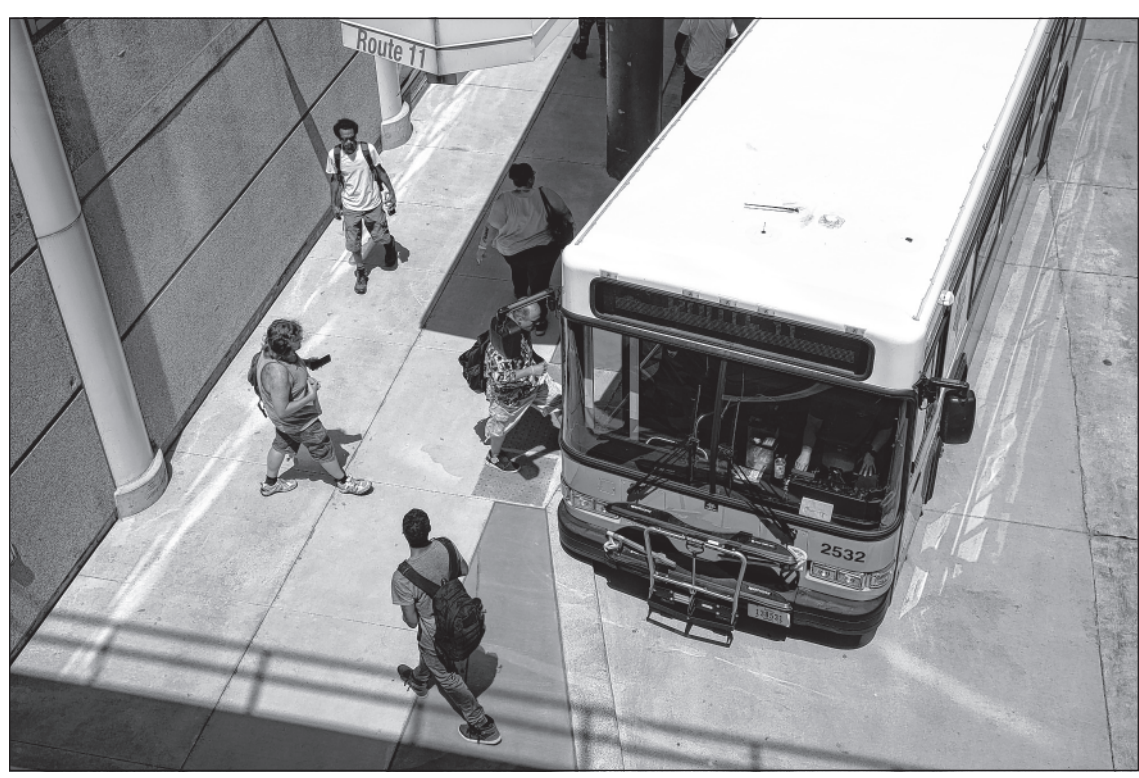
Transit users board a bus Wednesday at the ground transportation Center in Cedar Rapids.

To successfully reduce emissions while addressing the barriers residents face to accessing services, an important piece of the puzzle is continuing to build a multimodal transportation network and walkable neighborhoods