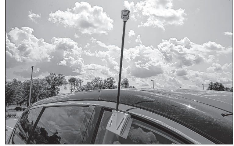
modal transportation network and walkable neighborhoods A sensor is seen July 22 on a volunteers car as part of the "Spot the Hot" program in Cedar Rapids. The NOAA grant-funded program seeks to map heat