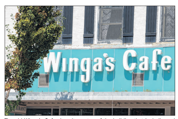
The old Winga's Cafe sign sits on top of the building that Isabella and Edward Santoro are renovating to turn into a diner in Washington.

While the Iowa Utilities Board will decide whether CO2 pipelines propo in the state get permits, other government bodies must sign off on parts of these multibillion-dollar projects. And some local regulations may throw a wrench in the works. Summit Carbon Solutions wants to build a 2,000-mile pipeline, with nearly 700 miles of it in Iowa, to transport carbon dioxide from ethanol plants to underground sequestration sites in North Dakota. The Iowa-based company has asked the utilities board