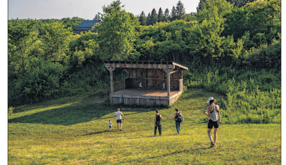
Visitors explore the Wilson's pavilion June 23 at Wilson's Orchard and Farm in Iowa City.

most of Iowa's agriculture is dedicated to crops that don't readily support tourism uses.