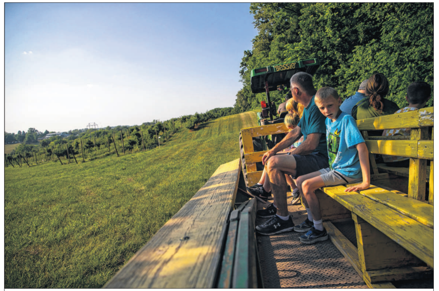
Visitors return to the main restaurant on a tractor after harvesting berries in the field on June 23 at Wilson's Orchard and Farm in Iowa City.