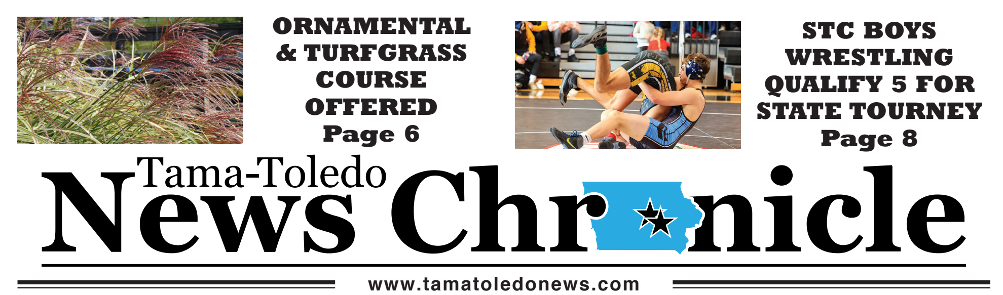
Friday, Feb. 17, 2023