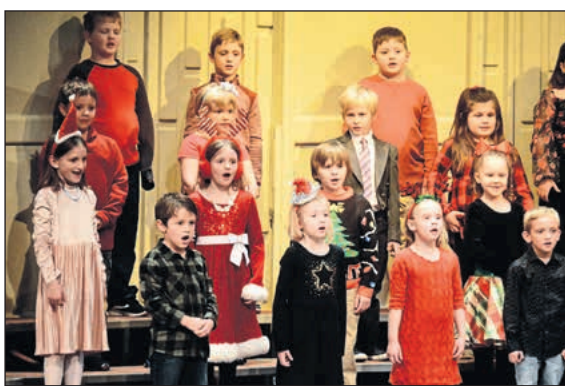
Lisbon first graders remind everyone "Santa Claus is Coming to Town."