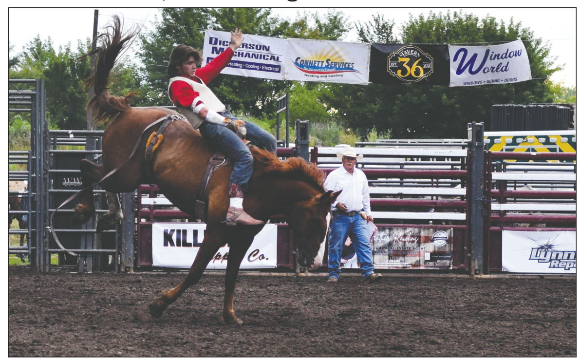
Cowboys and cowgirls entertained a packed horse arena during the Jasper County Fair Rodeo and Ty Carlson Memorial Bull Ride on July 14 at the county fairgrounds in Colfax.

Jasper County Fair kicks off festivities (and cowboys) with buckin' broncos, barrel racing and more