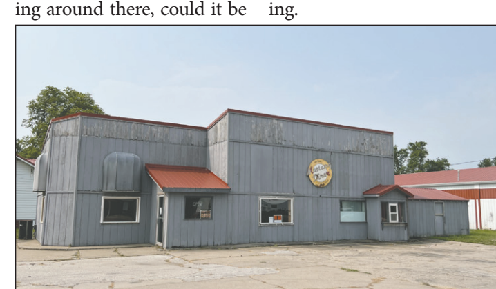
The former Mustang Diner has sold once again with the Monroe City Council approving a potential office space or coffee shop for the building.

A public hearing on the approval of the sale will be held at the Aug. 14 council meet-