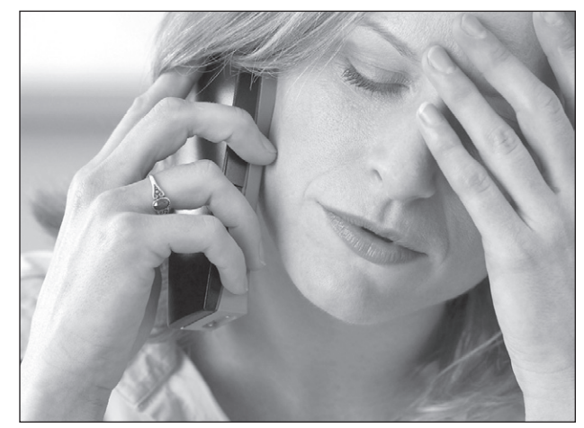
The 988 Suicide & Crisis Lifeline is a national network of local crisis centers that provide free and confidential support 24 hours a day, seven days a week.

In more than 97 percent of contacts answered by Foundation 2 Crisis Services and CommUnity in the last year, the issue was able to be adequately handled by the crisis counselor over