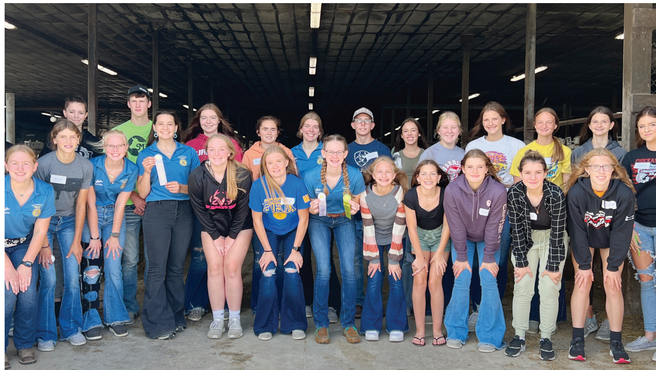
Pictured are South Winn FFA Members who participated at Tri-State Dairy Cattle & Dairy Products.