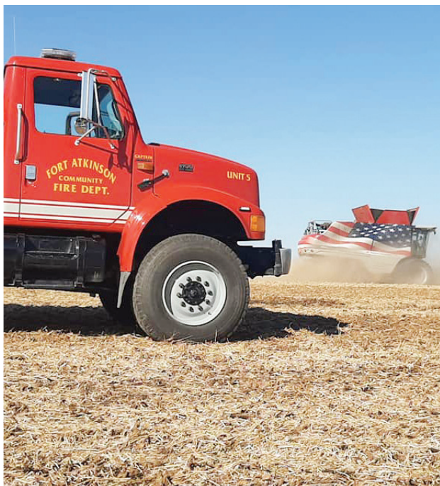
A field fire Saturday near Fort Atkinson was put out quickly, but dry conditions are among the headaches faced by farmers.

While the fire risk is relatively low this season for the area,