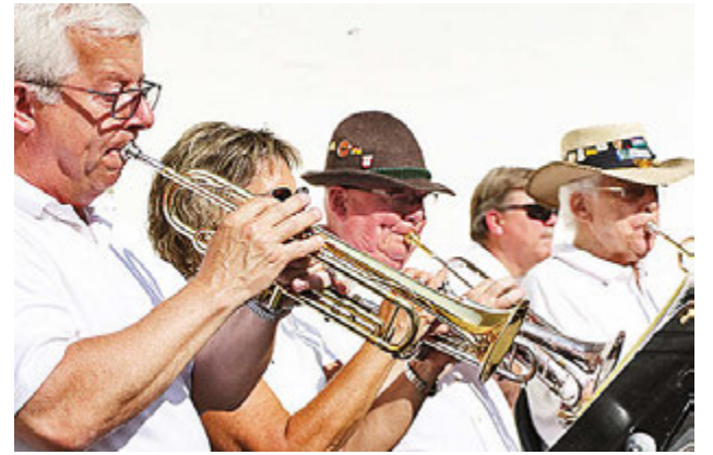
The Ackley German Band once again played their audience's favorites from the band shell in Victory Park. The group entertains during the annual kraut and weiners meal.