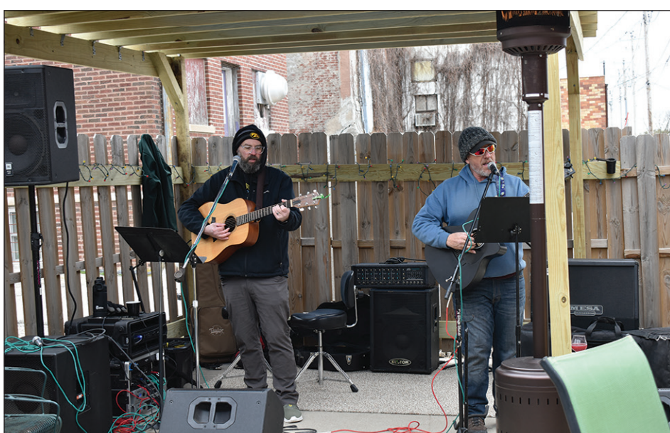
Unpolished Jams, an acoustic duo based in Grundy County, was one of the many live bands that rocked out at the Dig Inn.