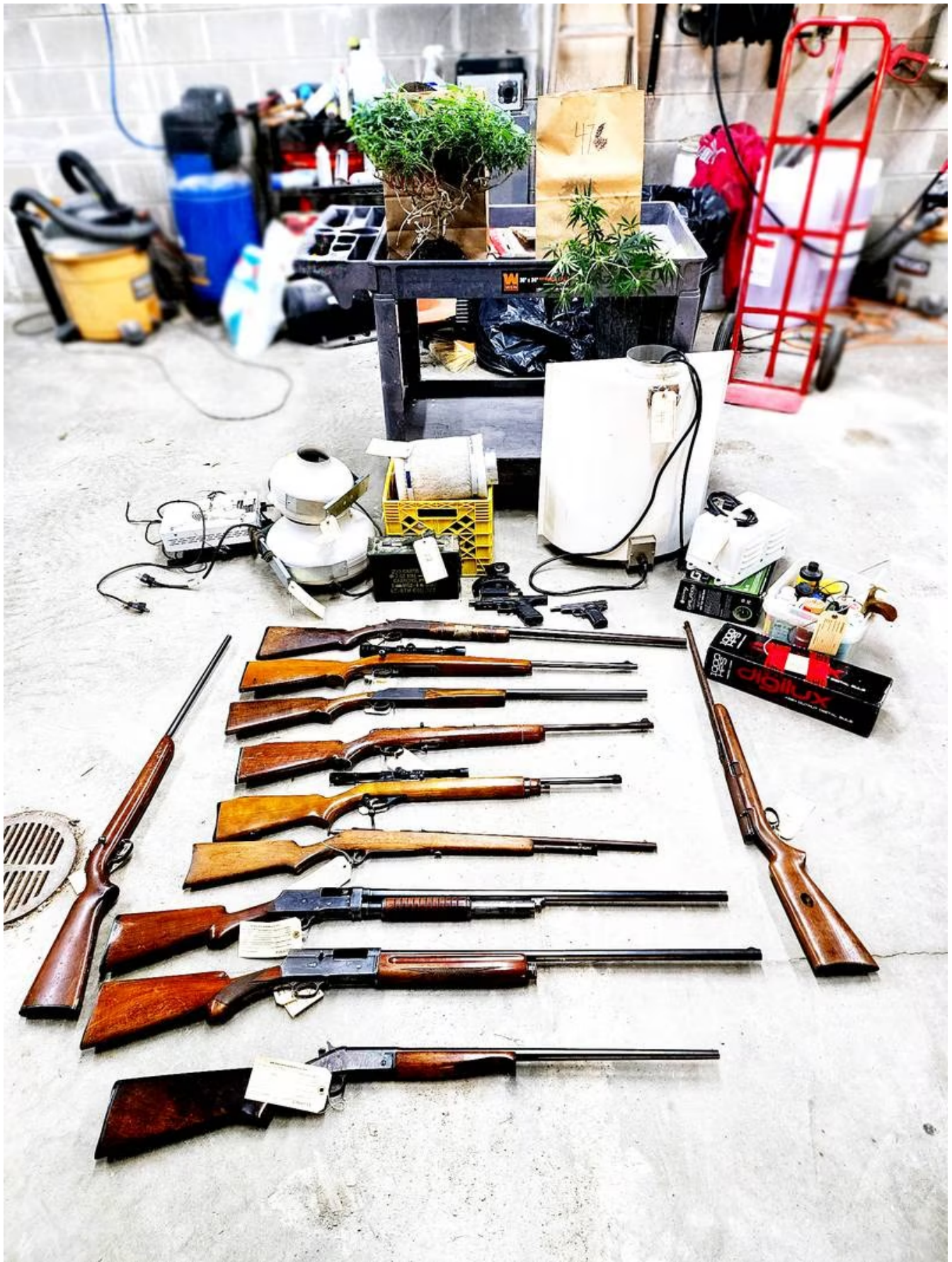
During an MJET search of a residence on the 1100 block of North Maple Street in Creston Monday, officers located and seized 13 firearms, five rooted marijuana plants, methamphetamine and drug paraphernalia.

Only months after local law enforcement agencies partnered to create the Multi-Jurisdictional Entry Team (MJET), the team is making a difference not just in Union County, but in surrounding counties as well.