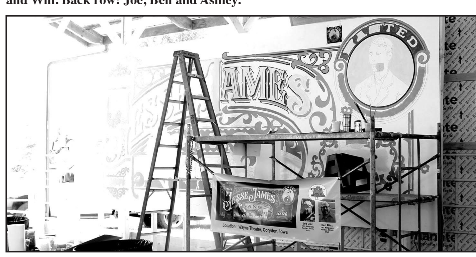
The above photo shows the early progress of the Jesse James mural.