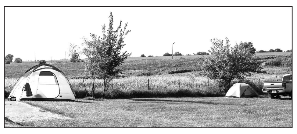
When visiting the Wayne County Fairgrounds to view progress on the murals, it wasn't uncommon to see tents set up for artists to camp in along with campers, R.V.'s, buses and some even stating they slept in their vehicles during the stay for the event.

"You can't use up creativity. The more you use, the more you have."