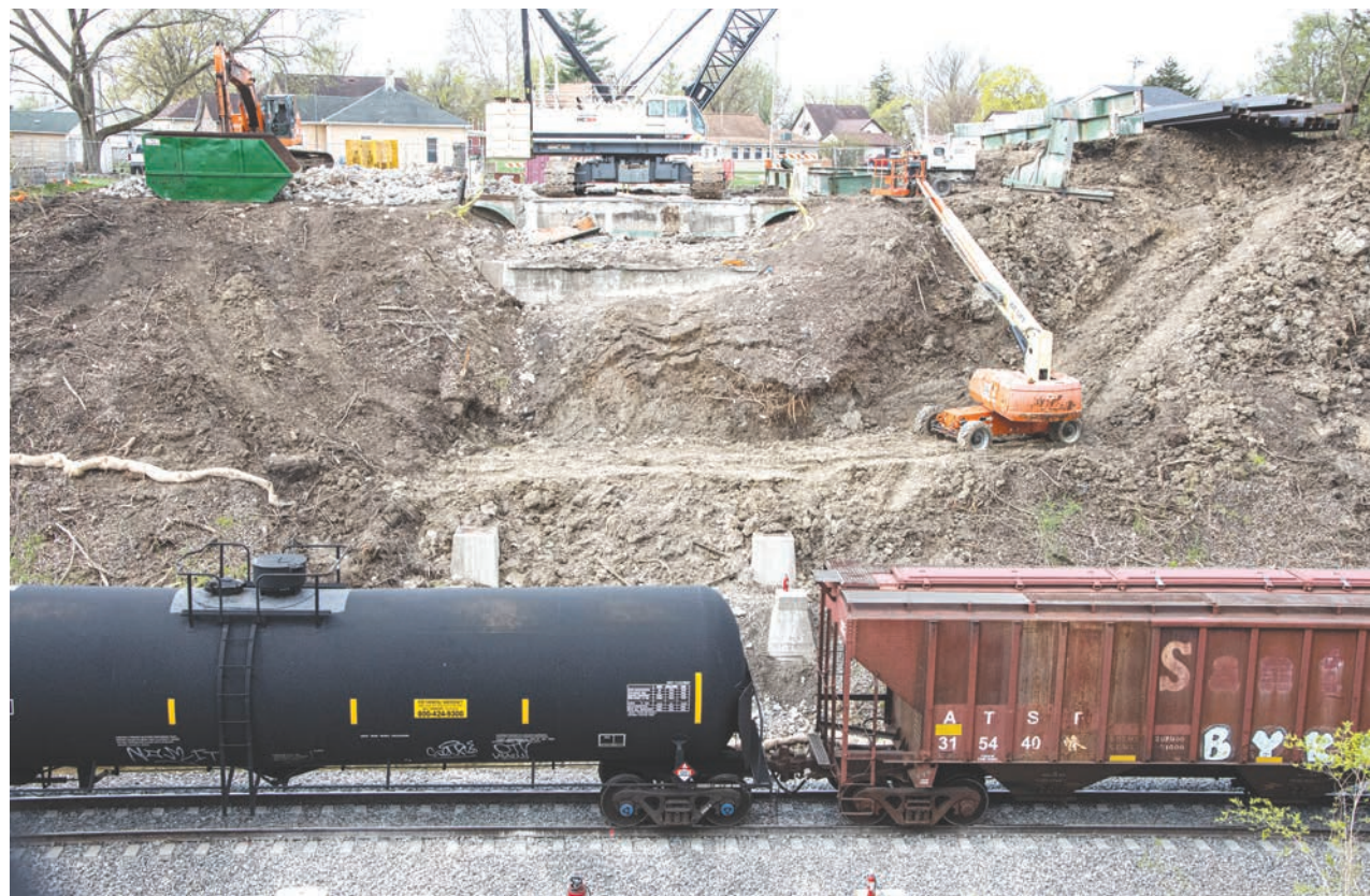
Work is continuing on the bridge replacement project on South Clinton Street in Albia. Pictured a train rolls through the South Albia Cut Sunday, April 23. The bridge, which is just south of Grant Elementary has now been completely removed. This is the first time since 1932 that a train has traveled on the tracks without that bridge above. The street closed in March and is estimated to remain closed until fall as the construction continues.