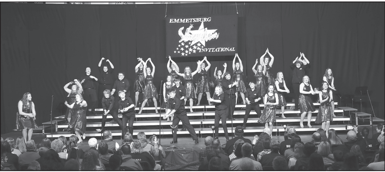
Sumner-Fredericksburg Sensations finished as Class 1A/2A champions and overall champions during the first round of competition at the Emmestburg Extravaganza show choir invitational.