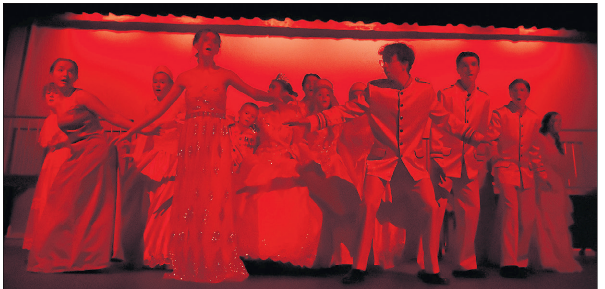
Danger from the Bolsheviks: The Romanov family huddles together for safety as the Bolsheviks arrive to execute them in a scene from the Solon Drama Department’s production of Anastasia. Tsar Nicholas II and the Romanov family (a dynasty lasting three centuries), were executed by Vladimir Lenin’s Red Army (Bolsheviks) in July 1918.