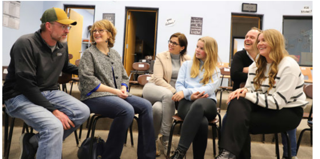
SHAWN DIGITY / TIMES CITIZEN

"We have to make a whole profile - things about yourself, what you like, what you don't like - and then you have to make a video about yourself, so they could see how you are, and then they were going to look for you, if you were a good match," Lieke explained.