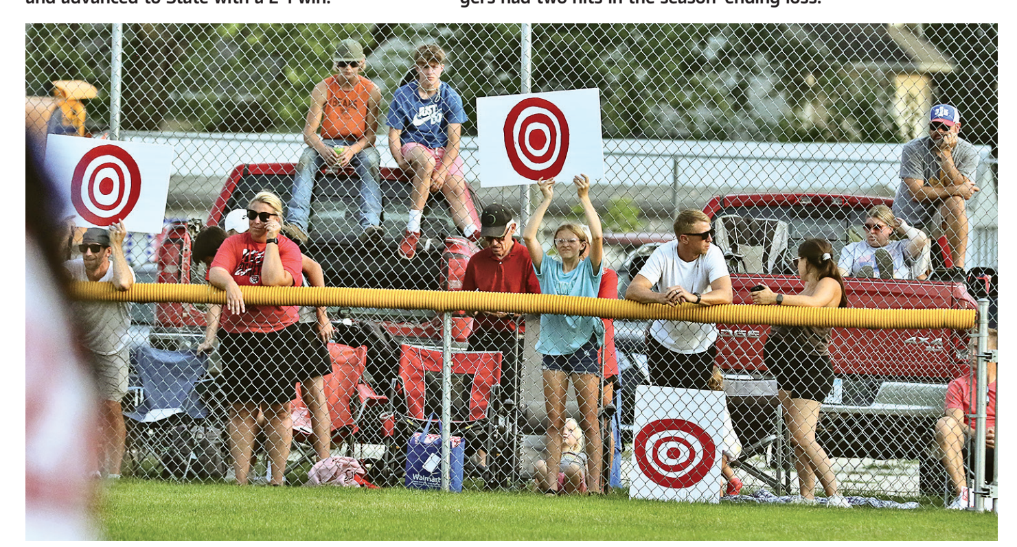
Tiger fans made the trek to Truro to watch the Class 2A Regional Final game between South Hardin and Interstate 35. The Tigers finished the season 27-8 and were one step from State for the second time in three years.