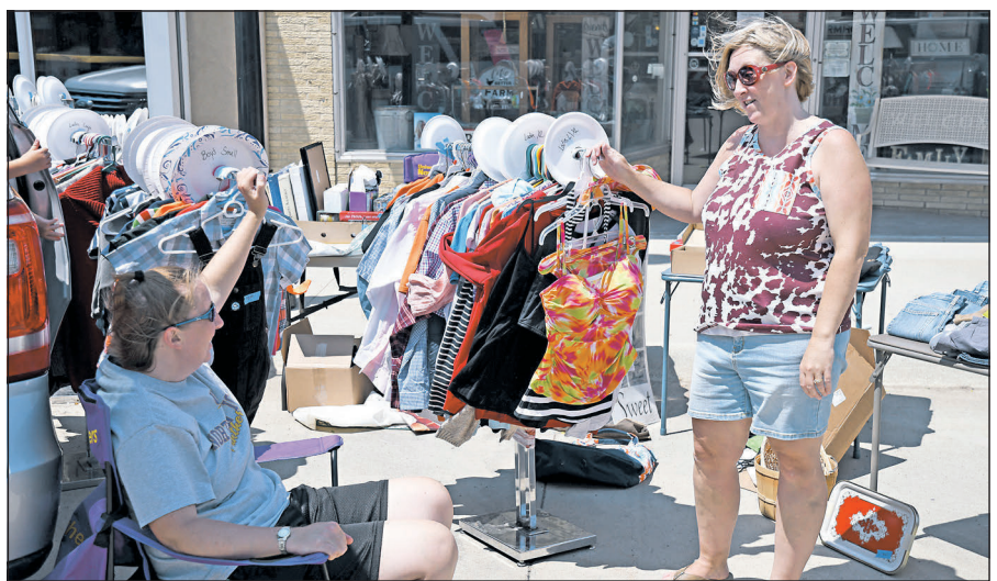
A vendor sells clothes at last year's Crazy Day in downtown Sheldon. Crazy Days has expanded to a four-day event this year. (File photo)

a "very patient-centered prac- See DENTIST on A7