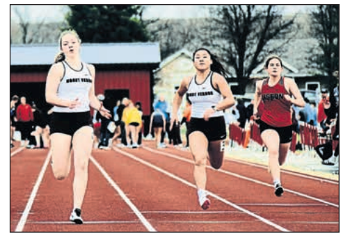
MV girls track preview Page 8A