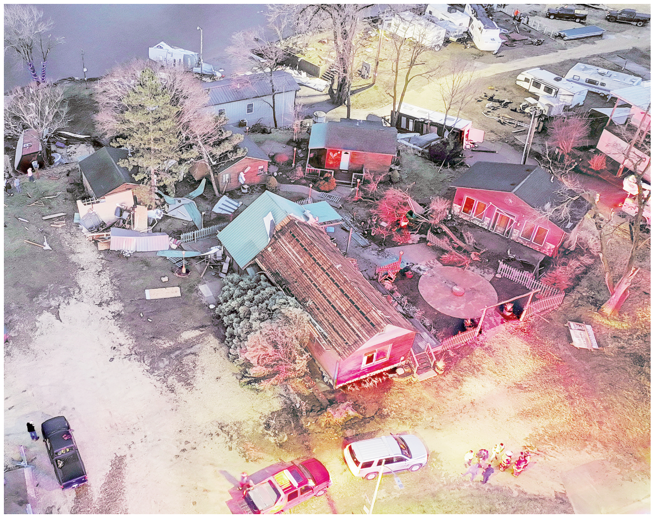
DAMAGE TO MOON RIVER CABINS is shown here just after the storm passed through Bellevue last Friday night.

Officials said the sudden hail storm also destroyed several trees, cabins and campers. Look for more updates on the storm in future issues of the Herald-Leader.