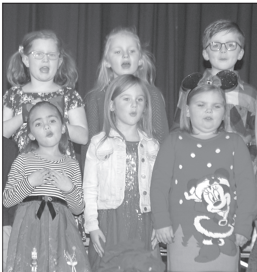
Elementary first-graders delight the crowd with the tune "If I Could Fly Like a Snowflake" for the winter concert.

Check out next week's Christmas edition for more concert photos.