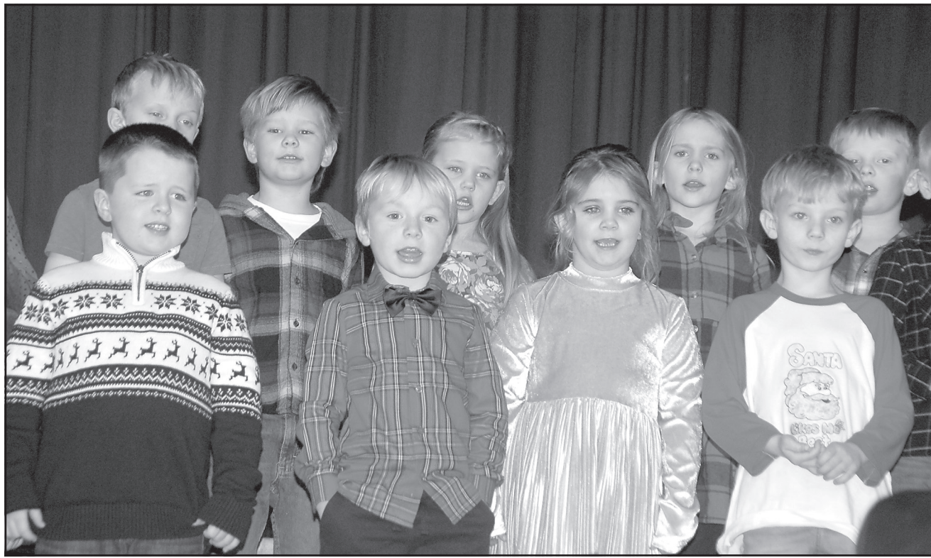
The kindergarten students at Tripoli Elementary perform the catchy tune "Under the Tree" last Thursday night, Dec. 8.

Deadline for news items and ads is noon on Monday.