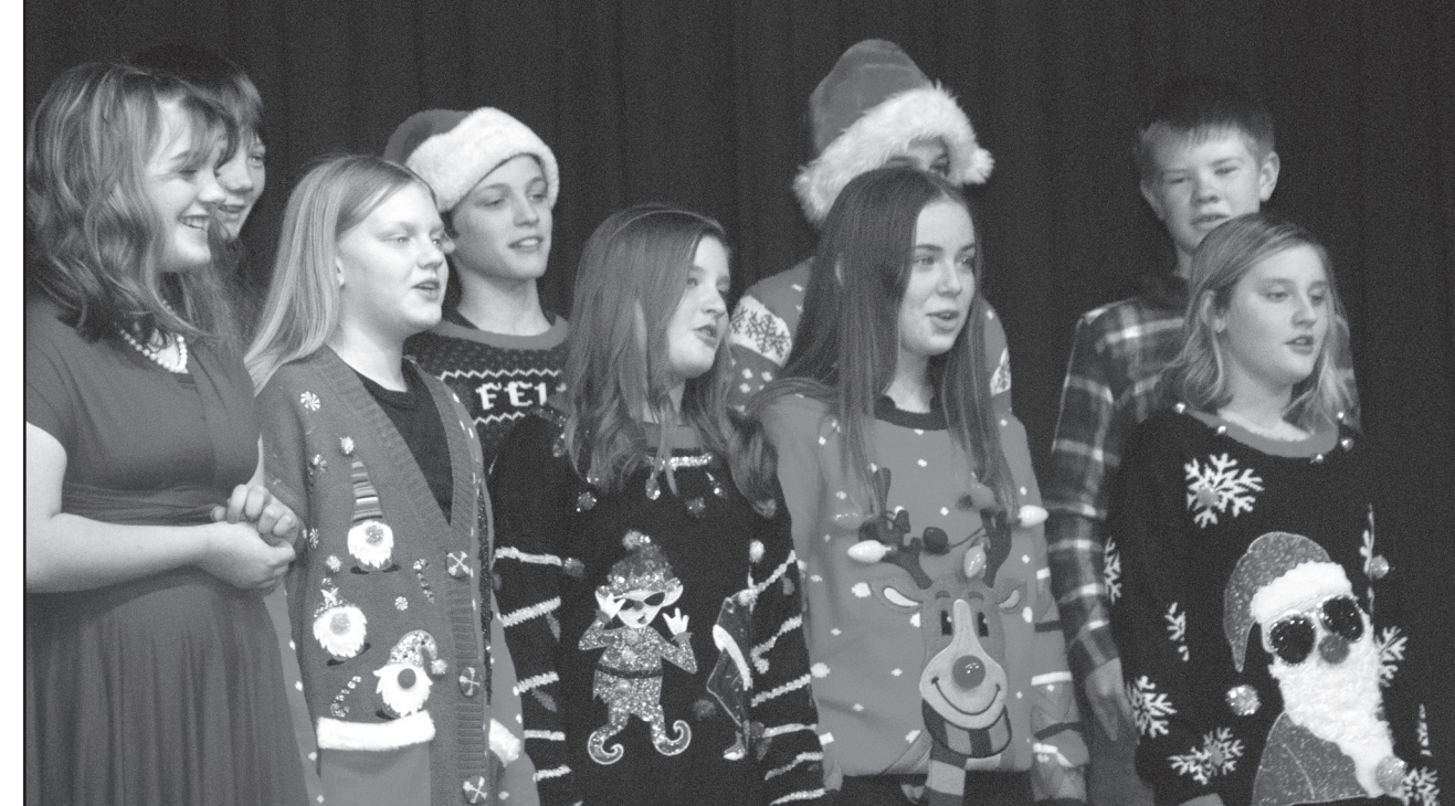
Sixth-grade choir members delight the audience with their rendition of "Ugly Christmas Sweater."

Vehicles can be parked in the city parking lots which include the gravel lot north of city hall and the Welcome Center parking lot north of the post