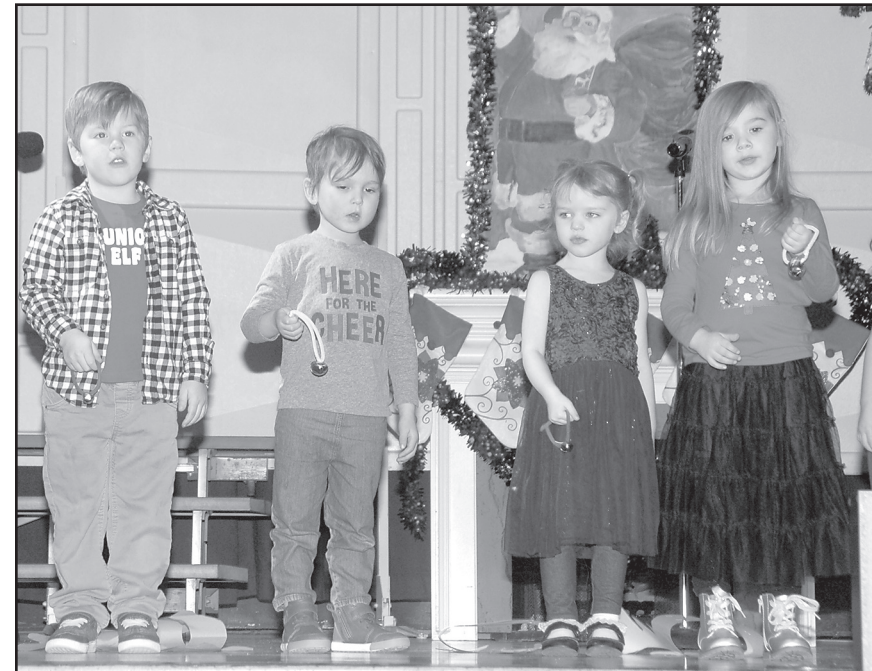
Fredericksburg Elementary preschool students shake their bells as they perform "Jingle Jingle Little Bell" to start the concert Monday night, Dec. 12.