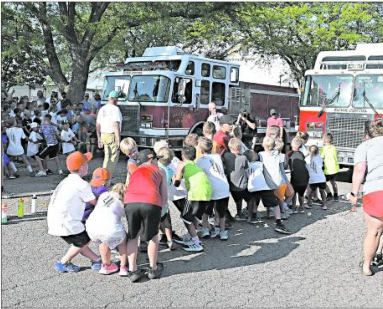
Two teams of kids in grades 3-5 race to see which group can pull a fire truck down the parking lot during the Day With the Pros camp in Sioux Center on Monday. Local players with NFL experience helped at the event.