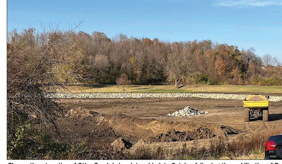
The southeast portion of Otter Creek Lake pictured in late October following the mobilization of Rachel Construction.

work was at least a month T. F. Clark Park and a half ahead of schedule, but was slowing down was becoming. Contractors would need to wait for restoration.