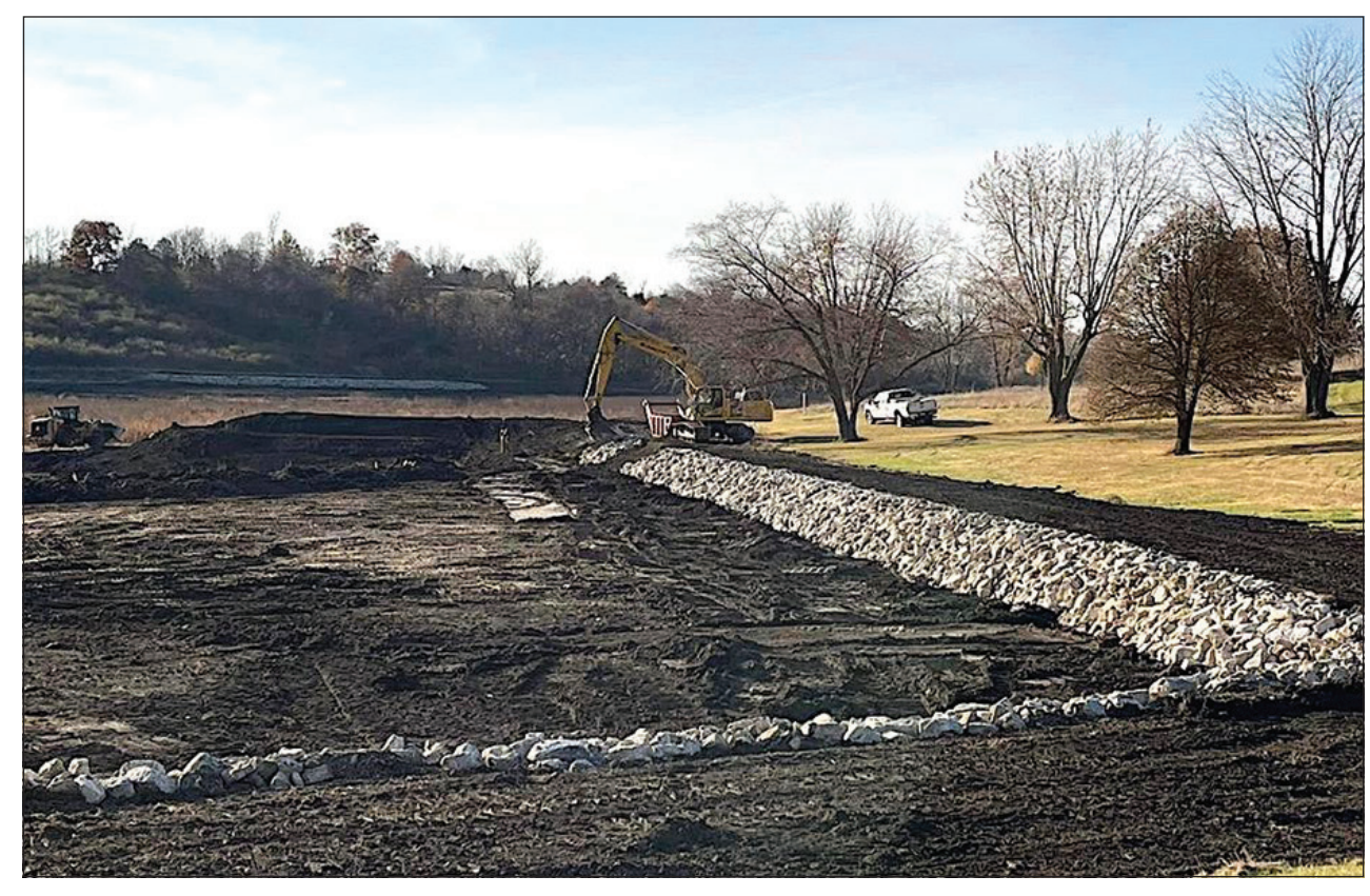
Contractors with Rachel Construction work to dredge the lakebed at Otter Creek Lake in late October.