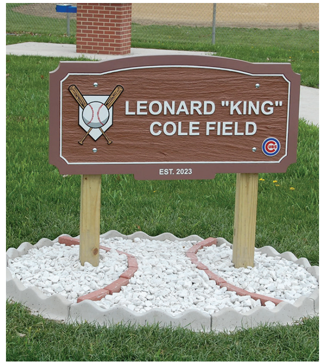
The new sign that labels Leonard "King" Cole Field.