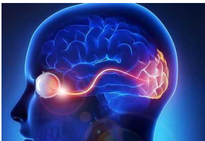
Struggling with Money? Do This Immediately!