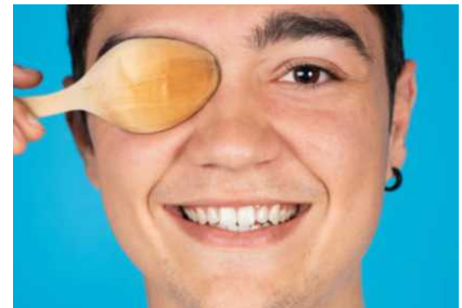
Get Rid of Your Vision Problems with This Groundbreaking Eye Trick