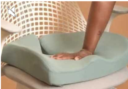
The cushions designed by the 60-year-old grandma are taking Wisconsin by storm!