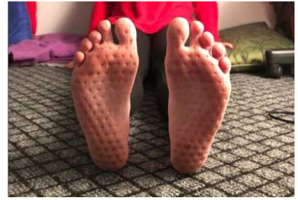
Neuropathy? Get Lasting Relief by Doing This 15 Minutes Per Day

RELATED NEWS: - New Helmet Uses 5G for the Deaf and Hard ... X