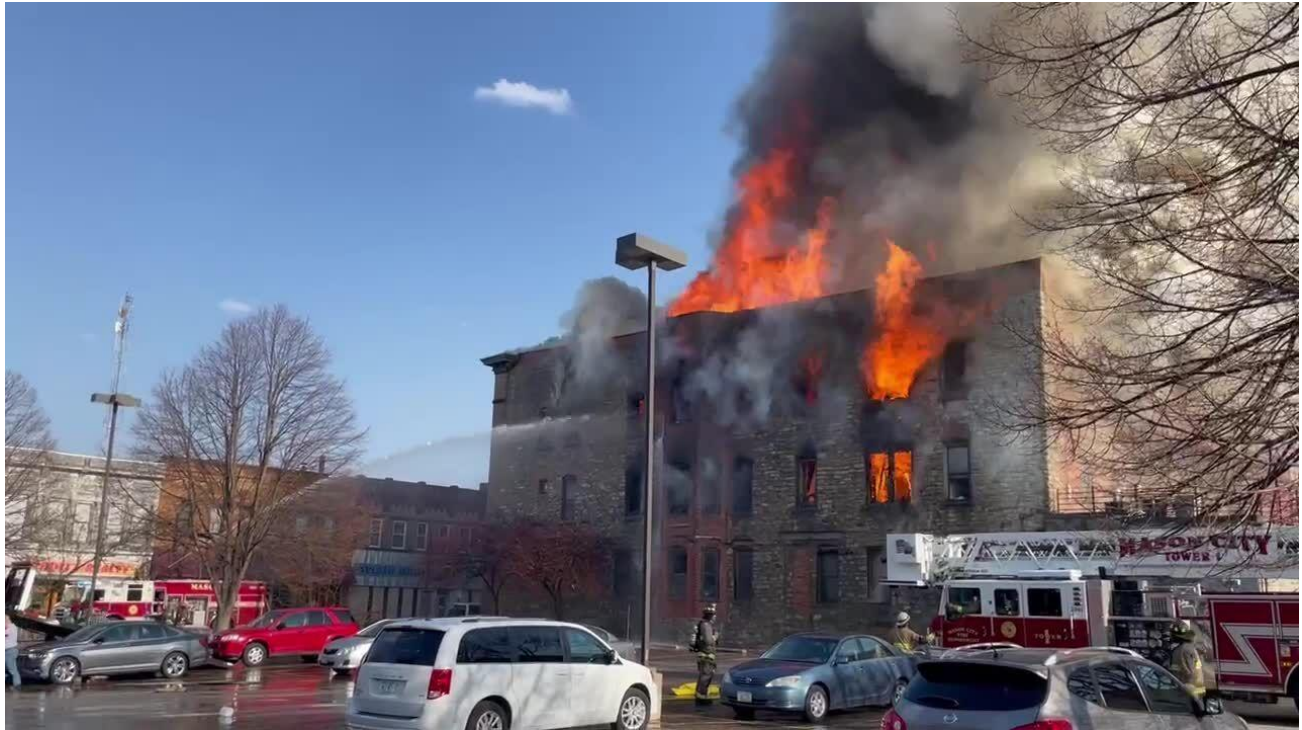
PHOTOS: Kirk Apartments in Mason City destroyed by huge fire