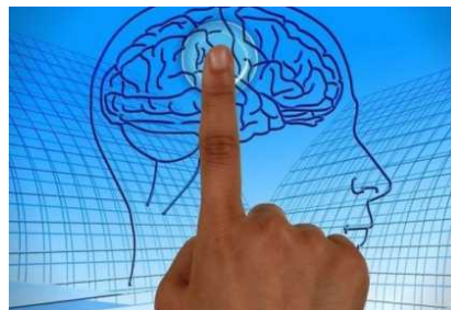
Do This Morning Ritual to Manifest Wealth!