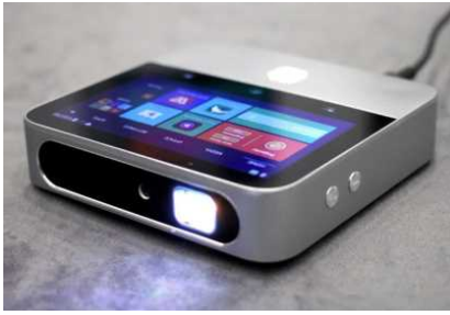
29+ Coolest Gifts Nobody Would Think of